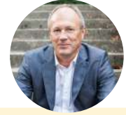
Dr. Miklos Szocska